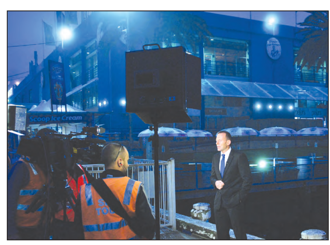
The leader of the Federal opposition Mr. Abbott on an early foggy morning at the Sydney Fish Market spruicking his opposition to the

congratulate them on keeping Sydney well market and in the shops.