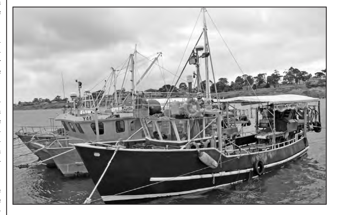
Victorian boaters are encouraged to be aware of the new marine safety legislation that came into effect on 1 July

and 1,500 commercial maritime operators to be ready for additional enforcement boater's safety responsibilities the new marine safety legisla- tools to address non-complition which took effect on 1 ance with marine safety legis- Corcoran