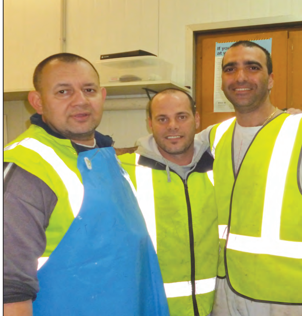
If you work in the seafood industry you don't need to be grumpy, bad tempered and foul mouthed All you need is a friendly smile, even if cracking one is not so easy on a cold Melbourne morning. The three gentlemen (above) from Sea Merchants, not only have great smiles but also the same barber

vided vital information for state and federal fisheries agenguaranteed long term access The study follows a survey re- cies involved in the manageleased by DPI today that estiment of southern bluefin tuna stocks throughout Australia