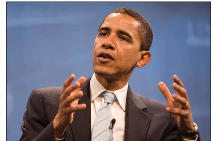
The President of the United States of America, Mr. Barack Obama who recently visited Australia and was treated to a meal of Australian seafood.

We asked a number of renowned chefs what Continued on page 2